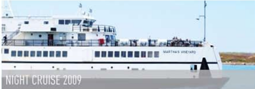
NIGHT CRUISE 2009

WHAT'S UP NIGHTLIFE BARS RESTAURANTS COOL STUFF EVENTS STORE